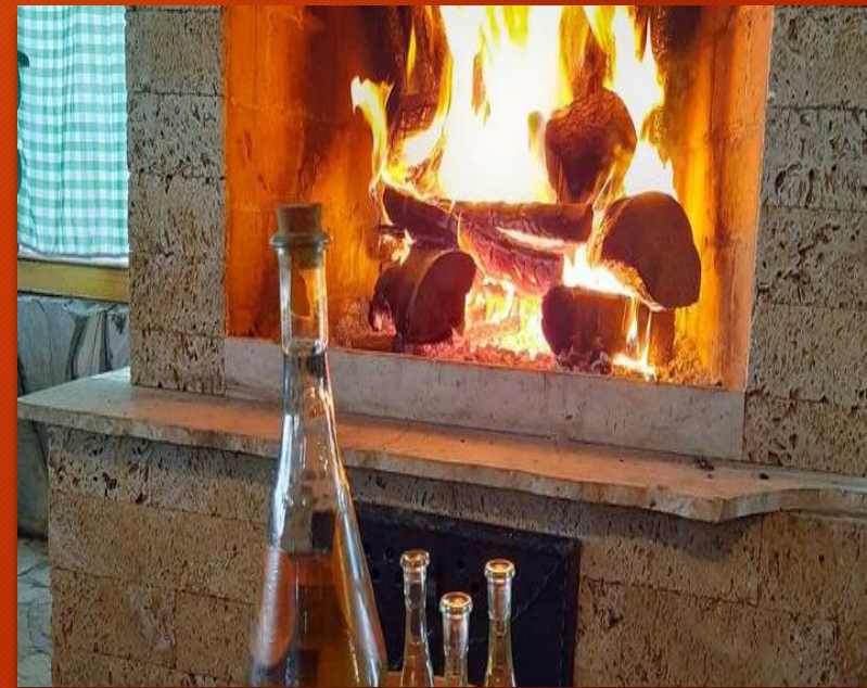
Third toust Rakija tasting