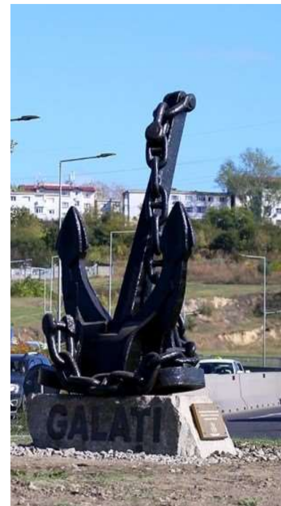
The entries from Galati. The one in the middle represents Galati fish market.