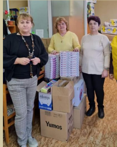
Help for the socially weak