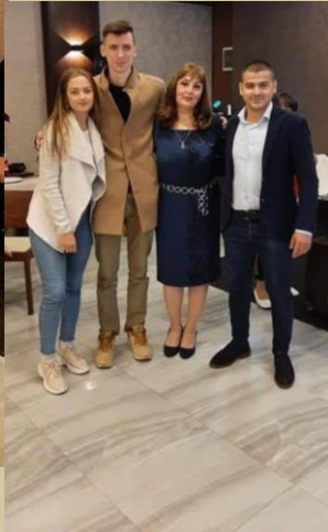
Congratulations from the PP of VMRO