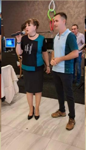
Congratulations on the Day of the Elderly from MP Ivan Belchev