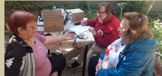
Volunteers take care of the health of the elderly