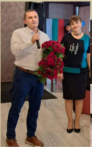
Greetings from the mayor of Ruse

Elderly people led a dignified life, they participated in the building of their country with great energy, dedication and faith, therefore the younger generation should be grateful and respect them. This respect is felt on every holiday when flowers and gifts and wonderful greetings are addressed to the elderly.