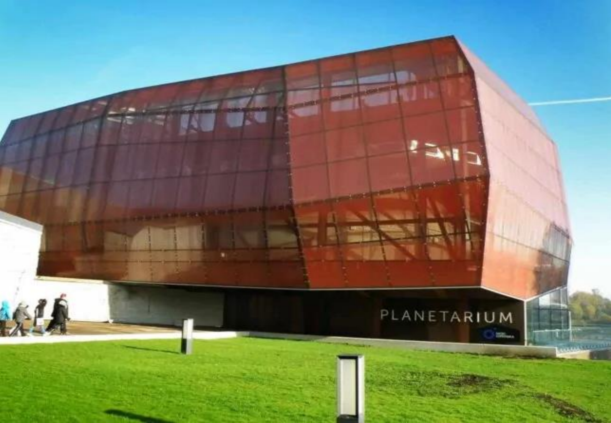
Copernicus Science Center