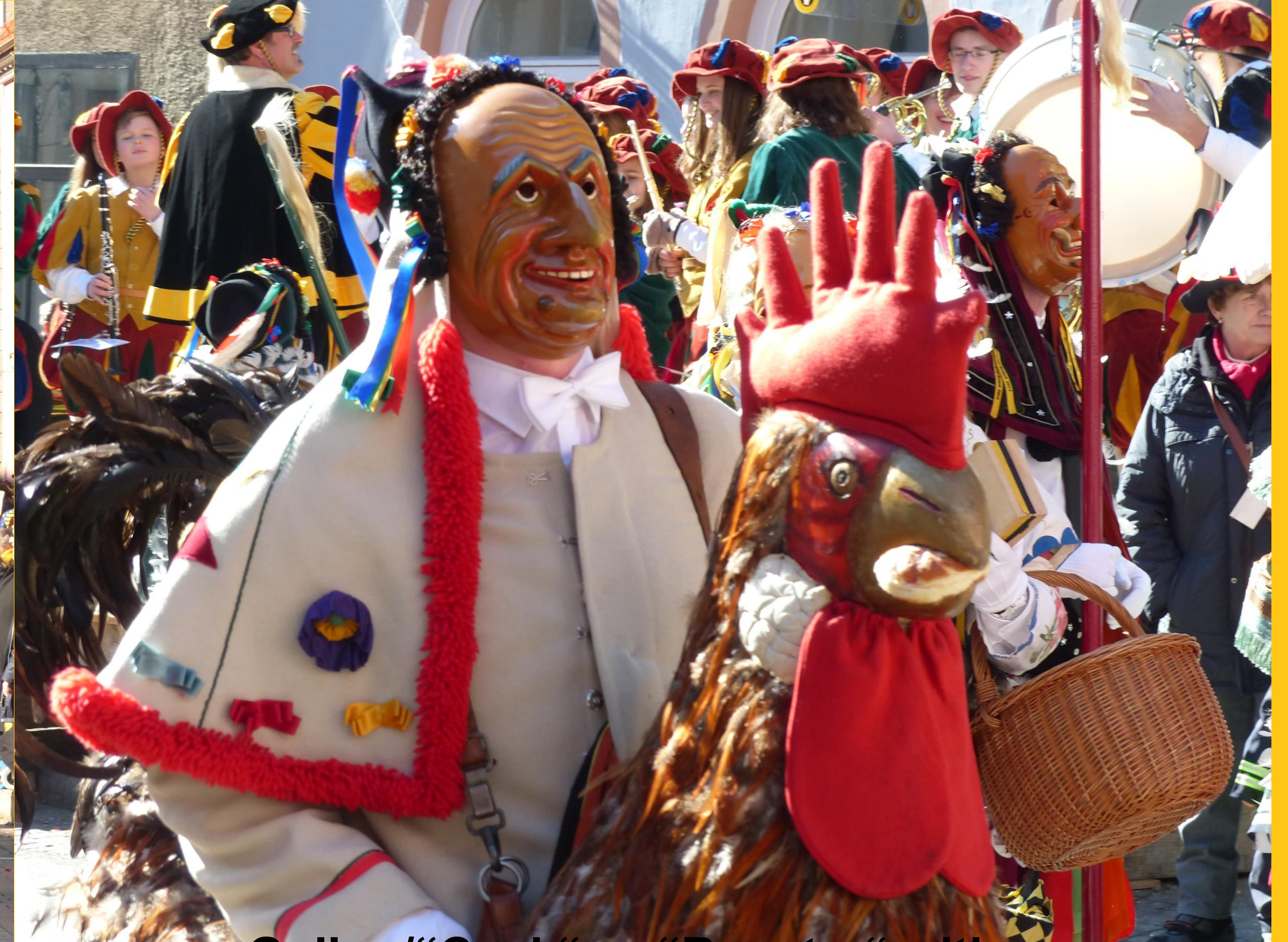
Guller /“Cock” or “Rooster” with a doughnut