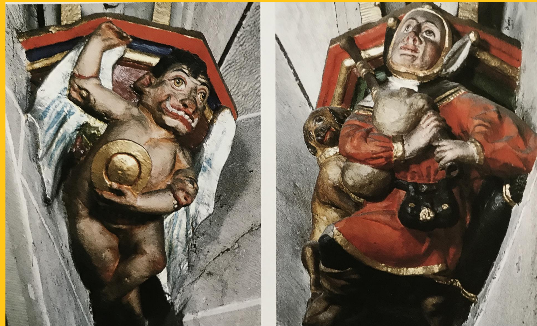
Civitas diabolica: figure of a devil figure of a jester (with bagpipe)