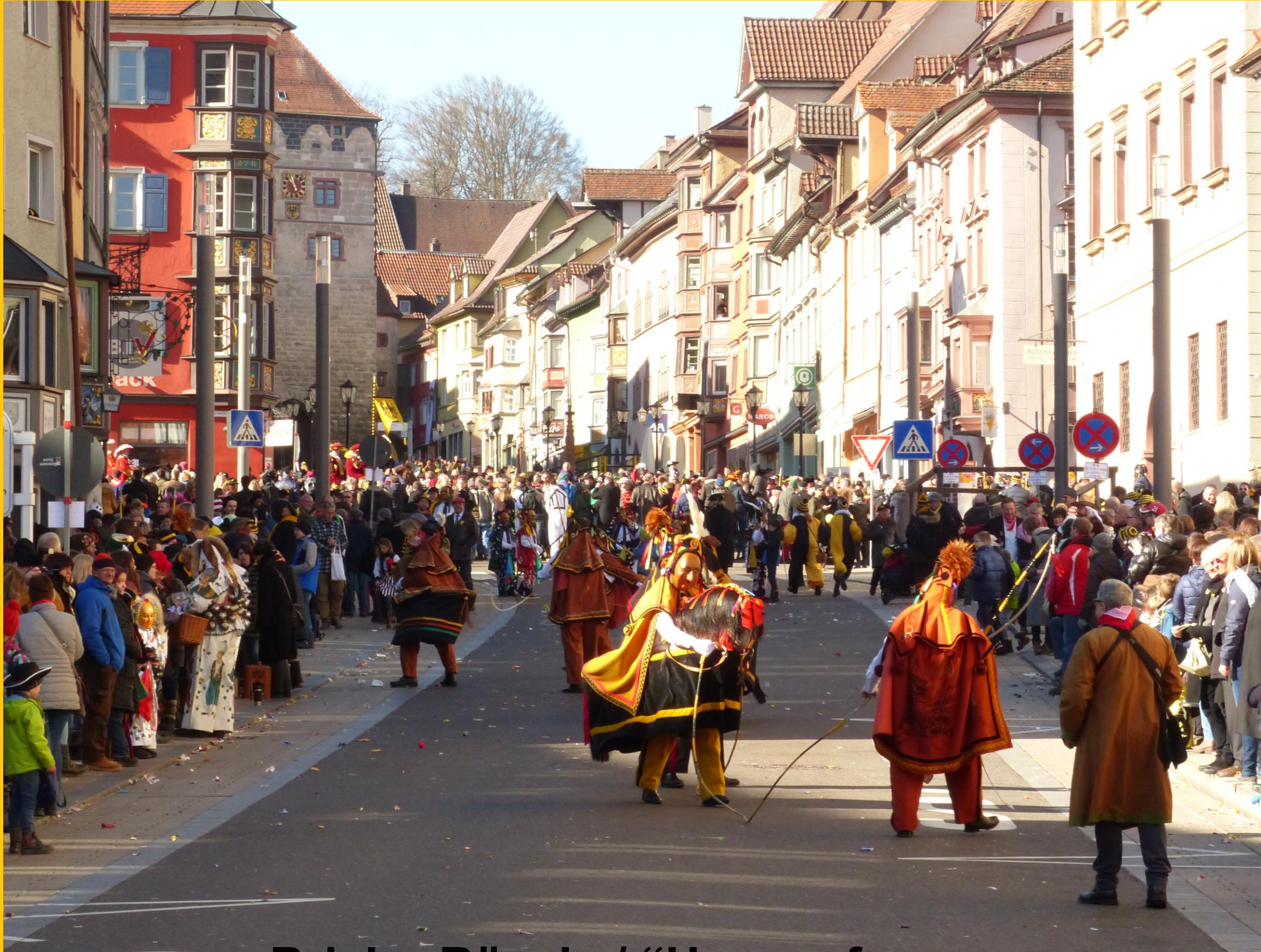
Brieler Rössle / “Horses from Briel”