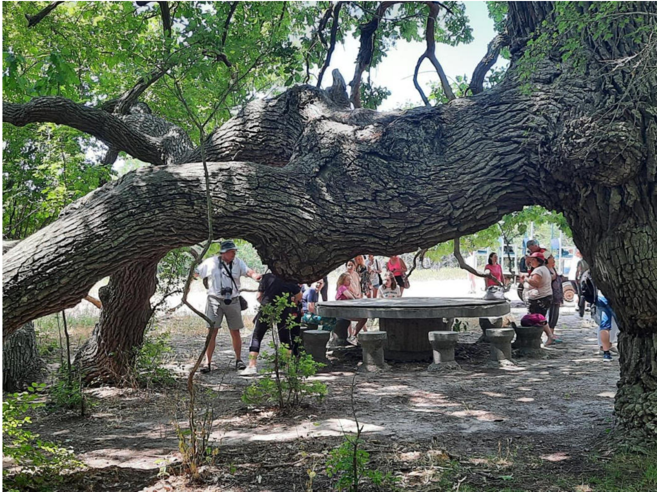
Our group paying a visit to the kneeling oak