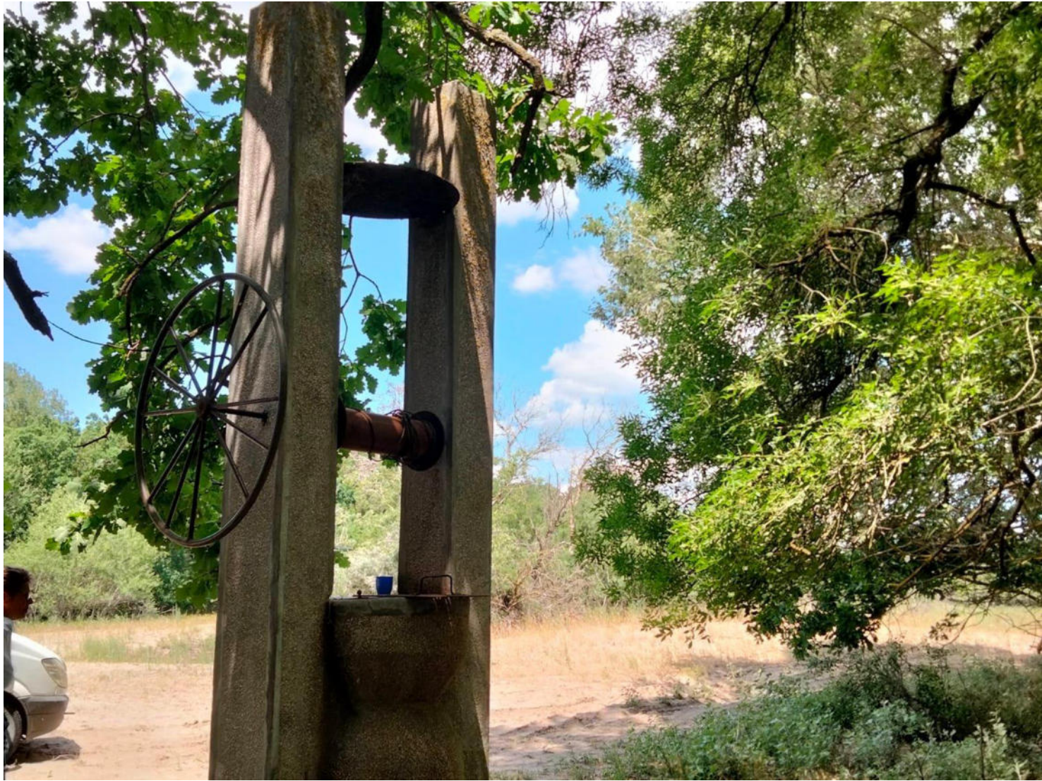
A fountain dug in the woods for the thirsty hiker