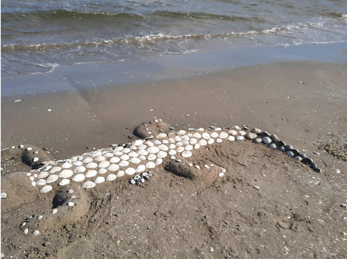
Sand forms decorated with mussels