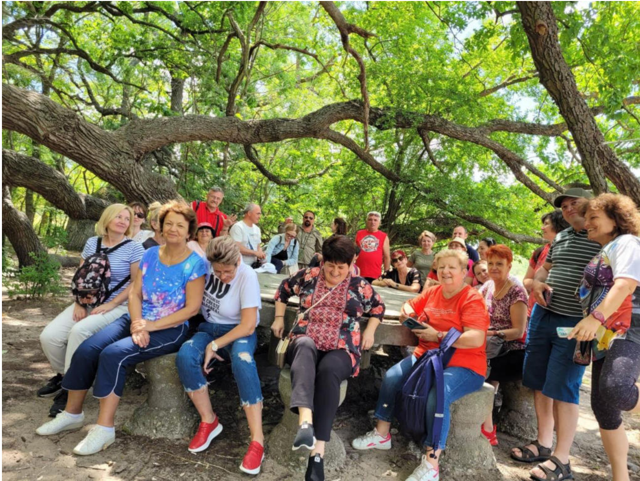
Happy under the kneeling oak and around the Table of Silence