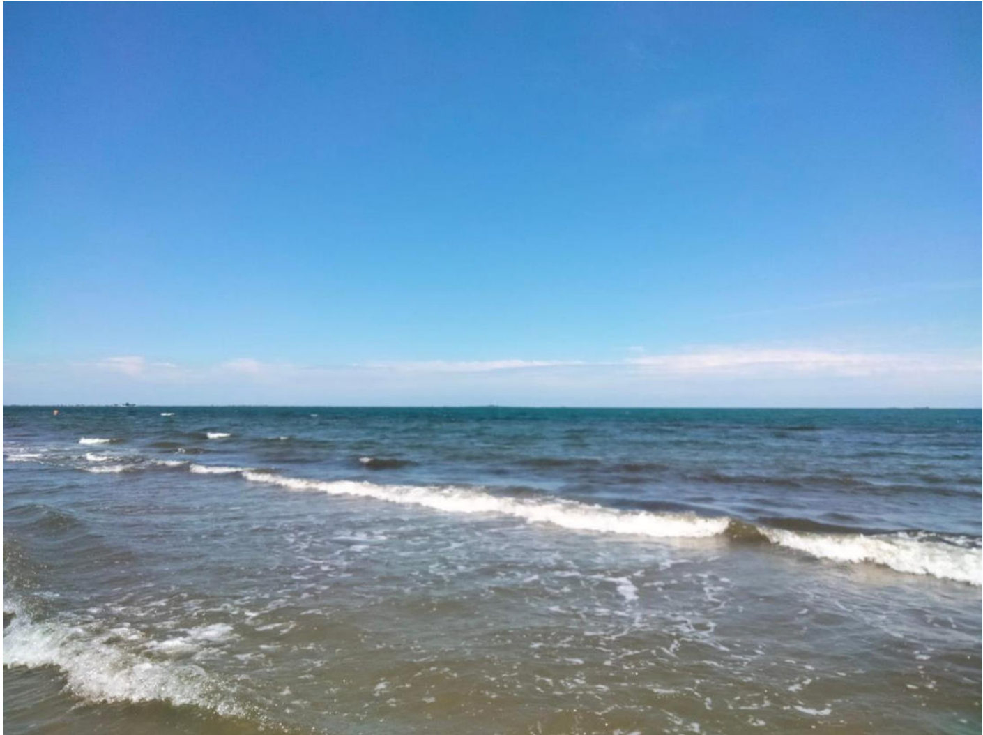
The Black Sea at Sulina