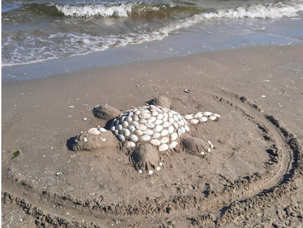
Sand forms decorated with mussels