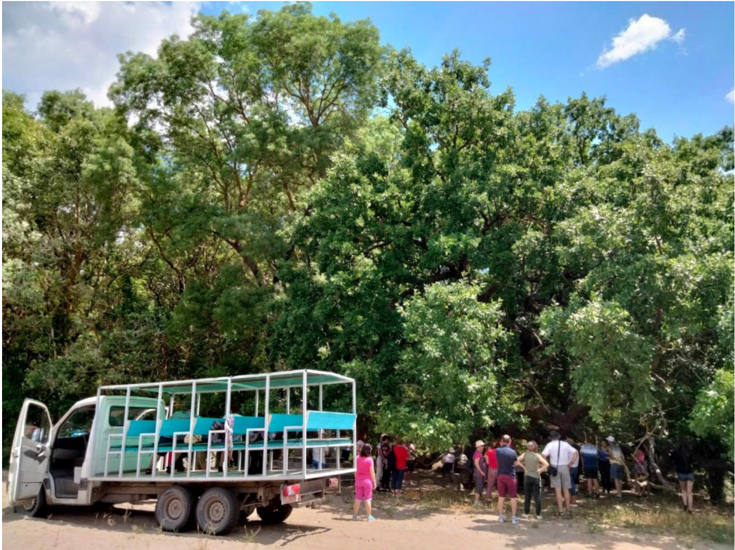
Safari trip to the Caraorman Forest