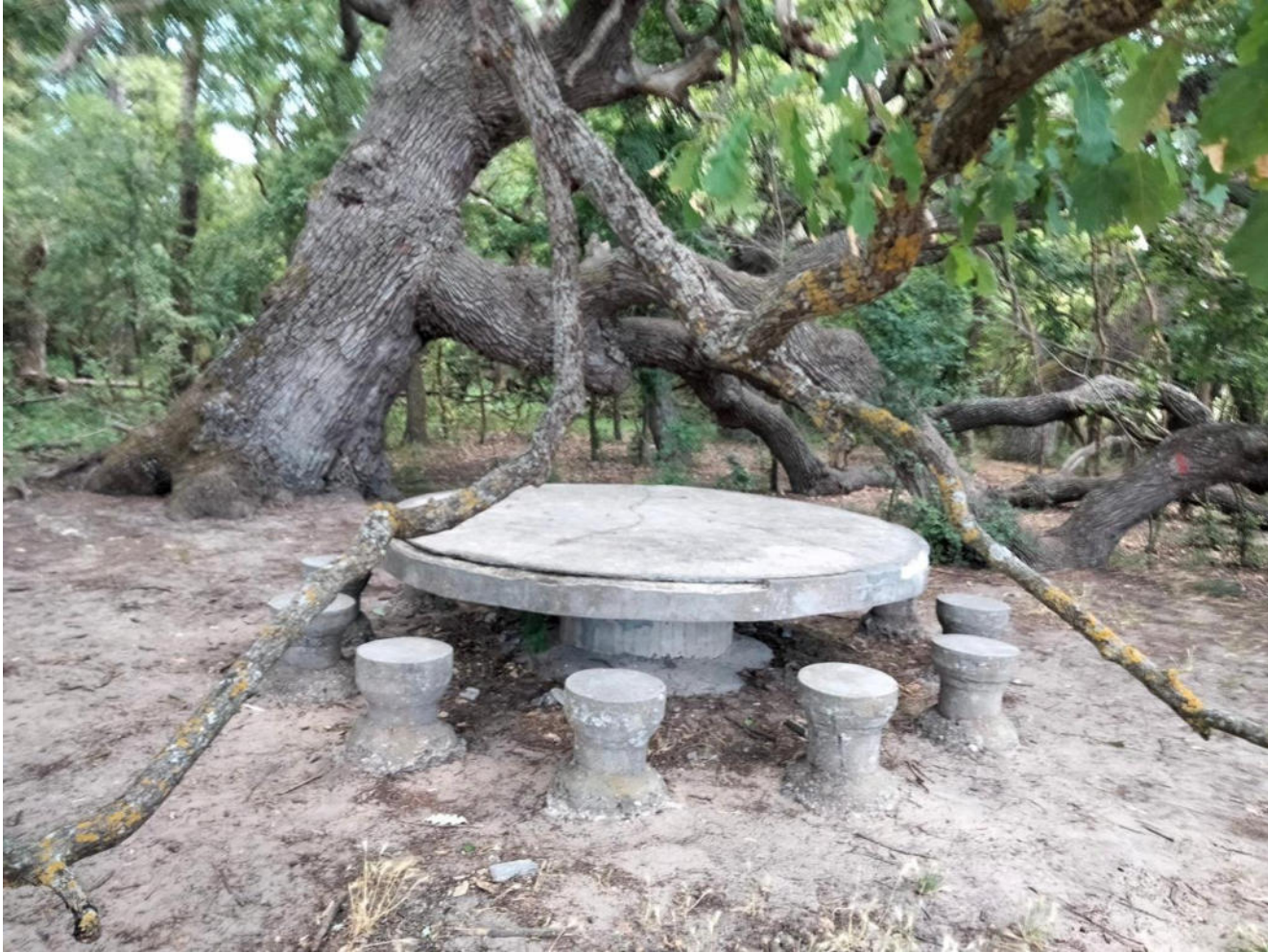
The kneeling oak tree and a replica of the sculpture „The Table of Silence”