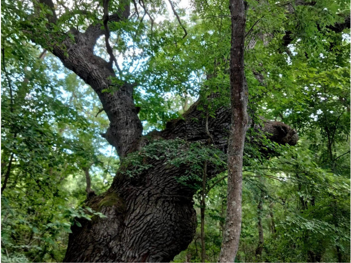
Old oak tree