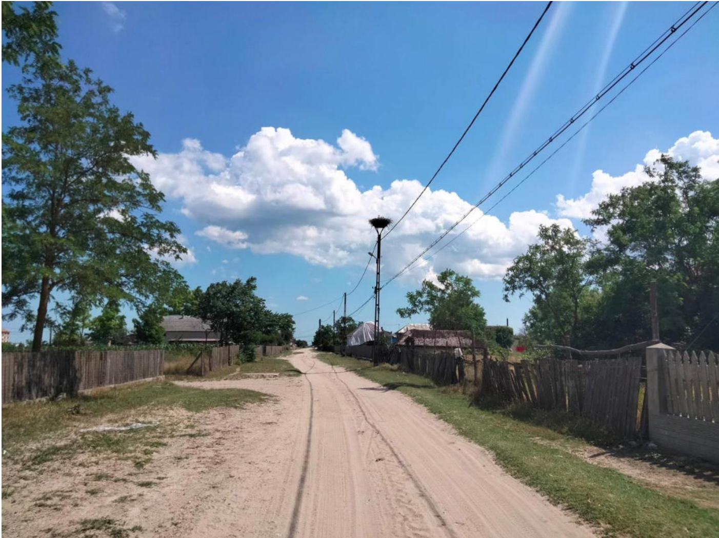
The modest village of Caraorman