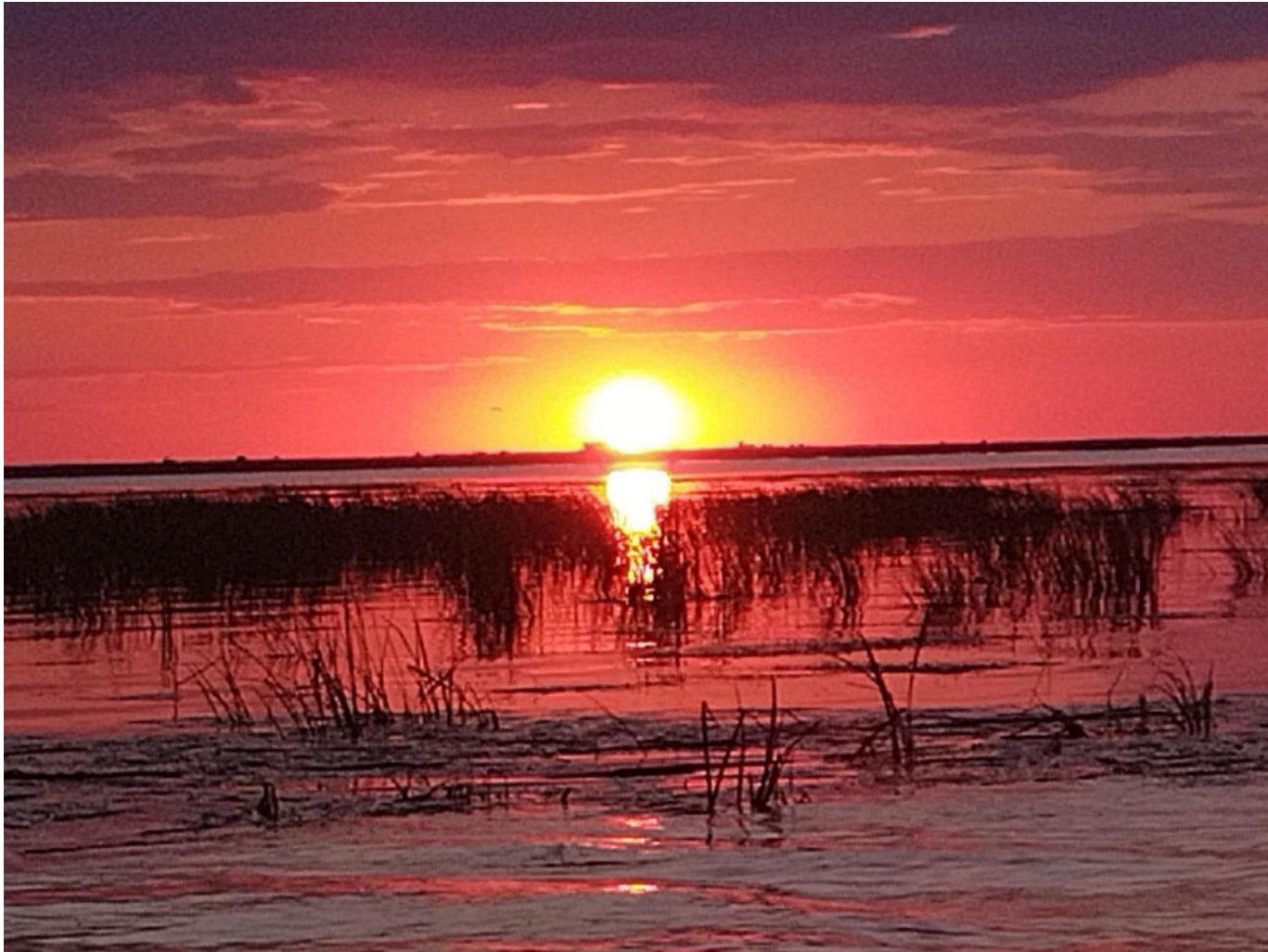
And a magic, breathtaking sunset.