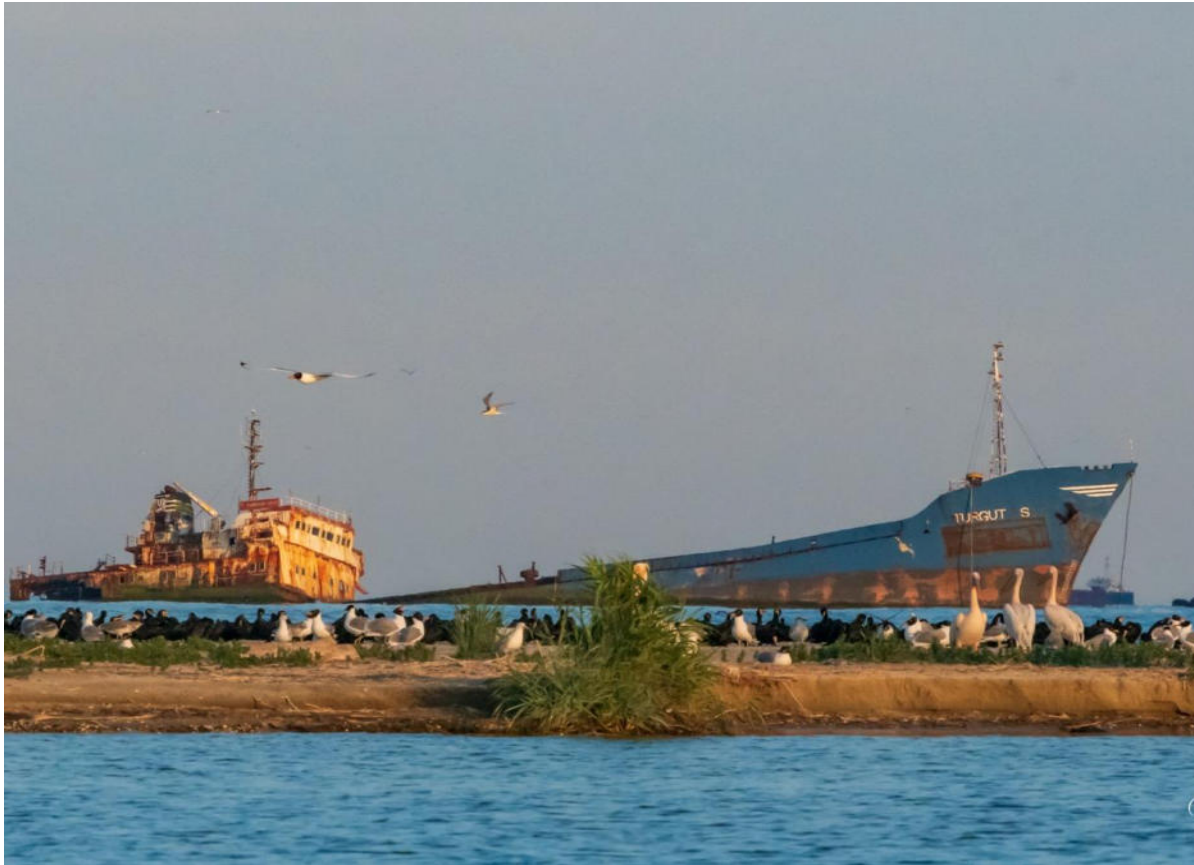
The K Island from another angle, having the shipwreck as a background