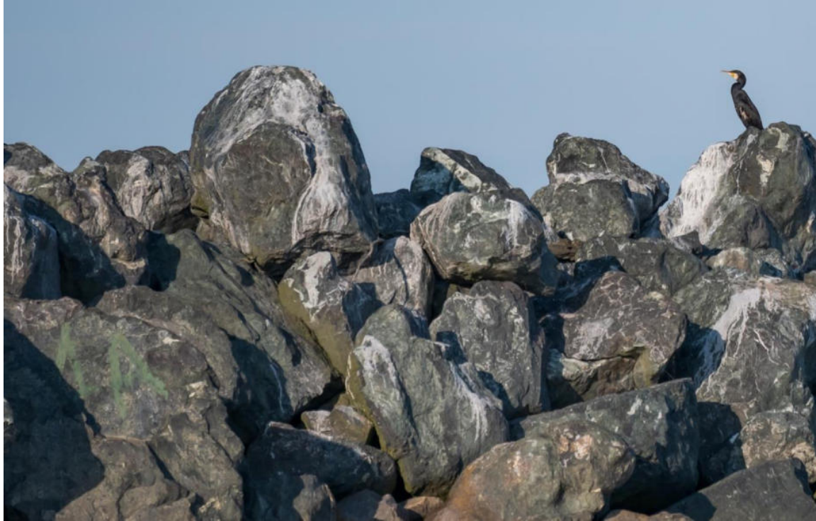
The black cormorant