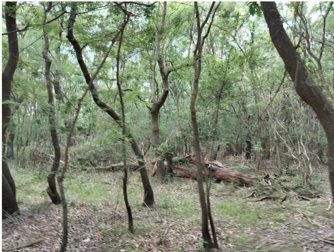
The Caraorman wild Forest