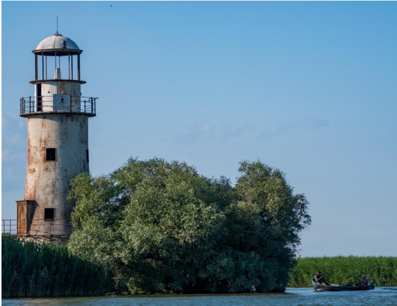
The old lighthouse, we passed by on our way to the K Island