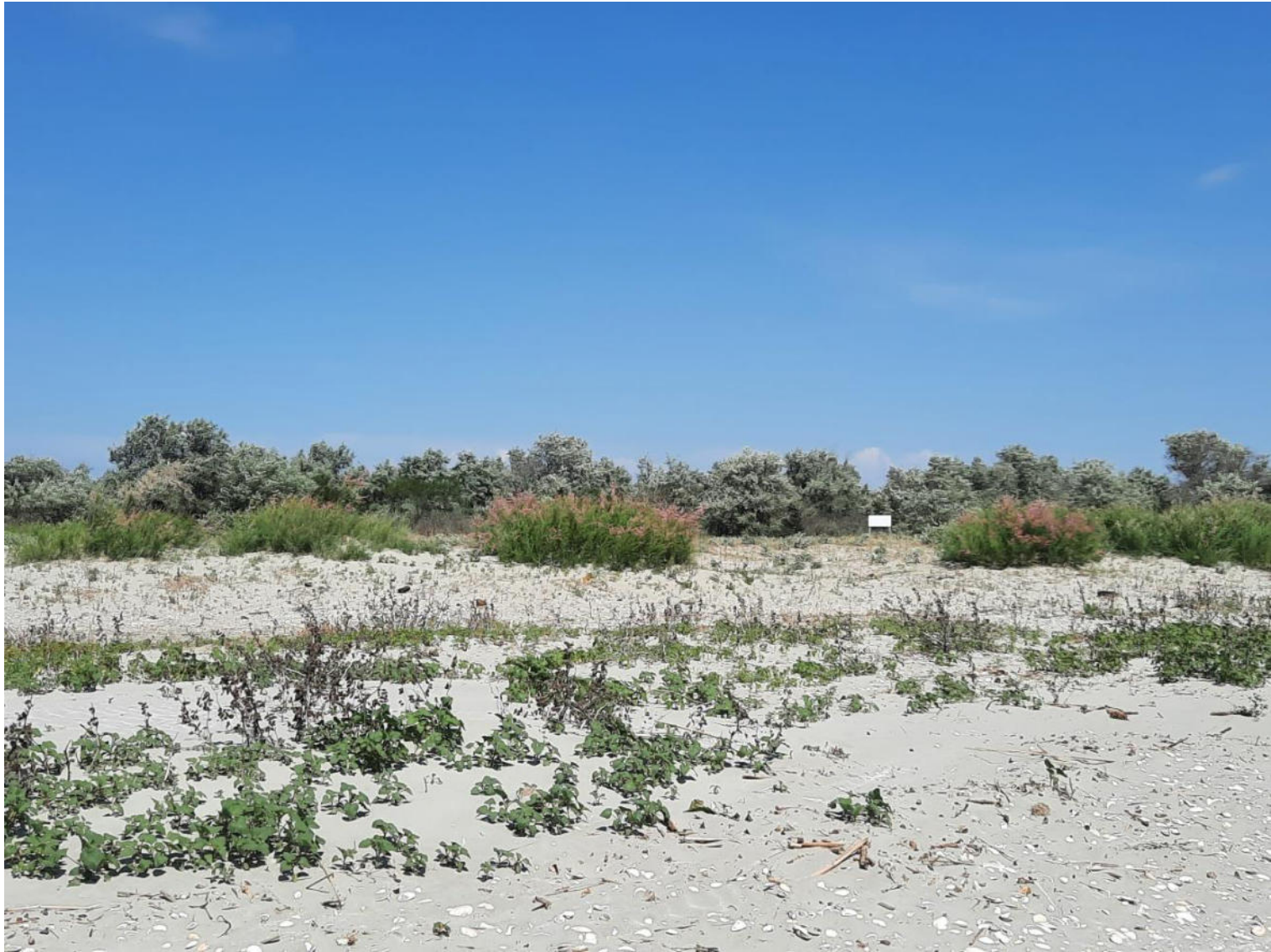
Tall grasses and thistles