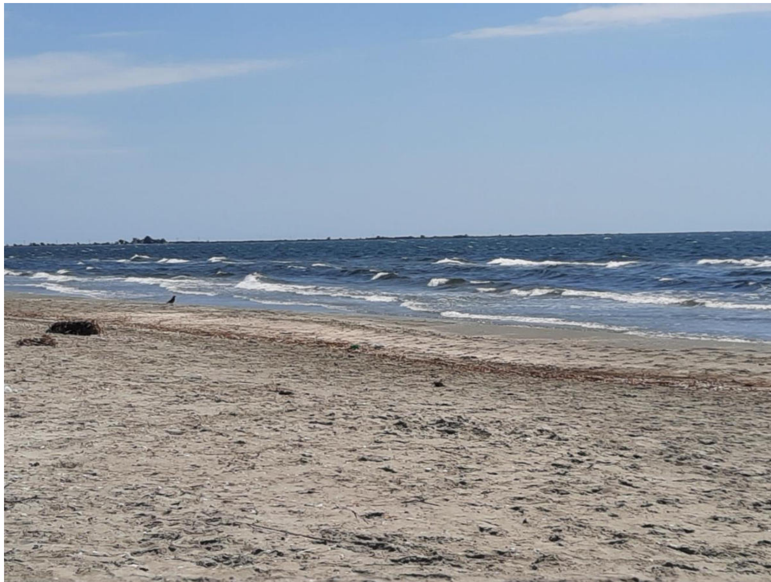
The magic of the natural Black Sea coastline