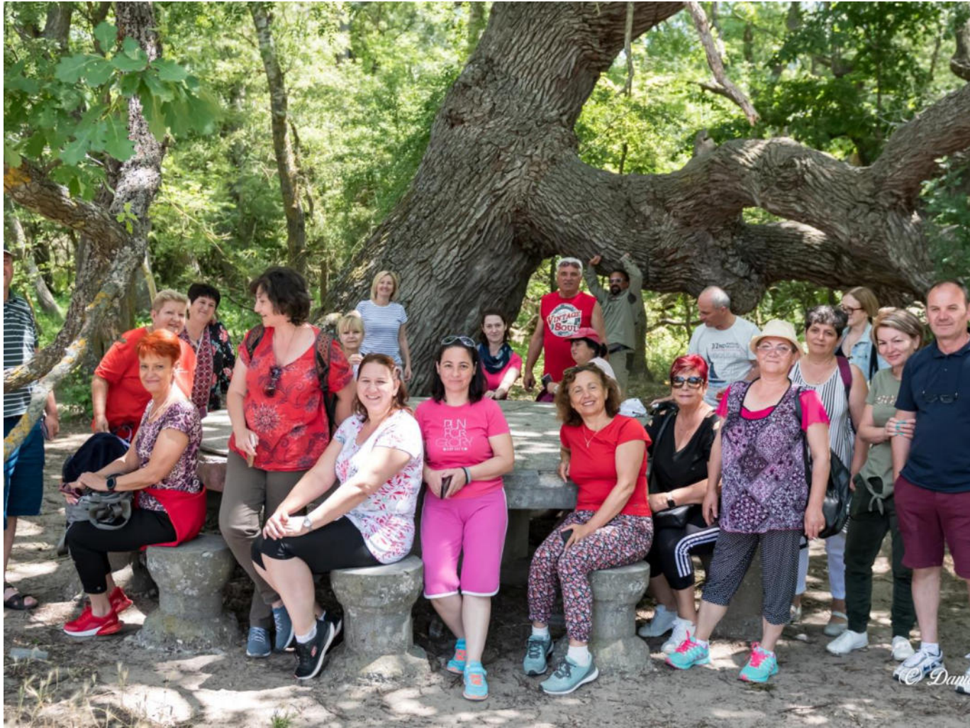
Happy under the kneeling oak and around the Table of Silence