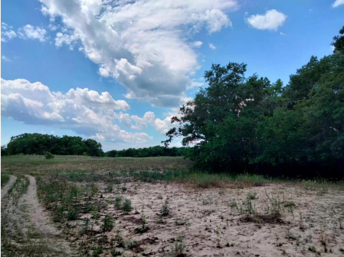
The Caraorman Island in the middle of the Danube Delta