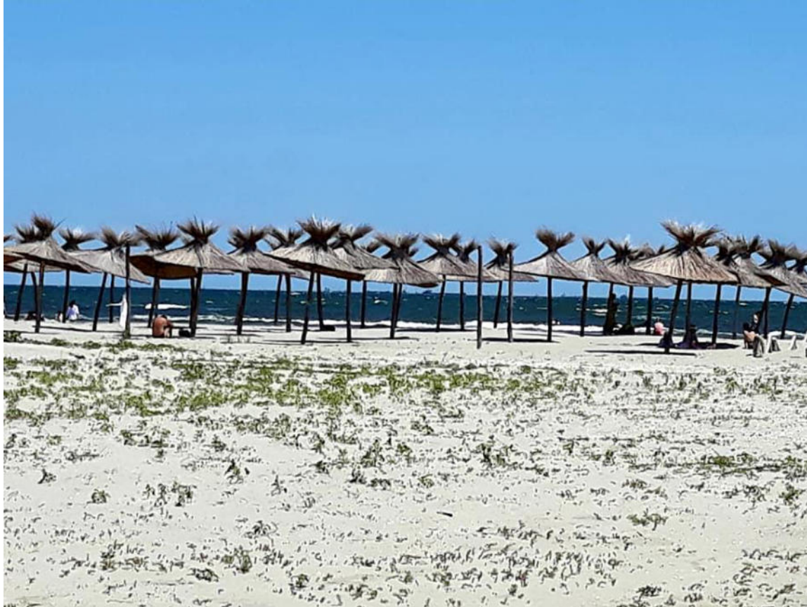
Grass and thistles growing out of the sand