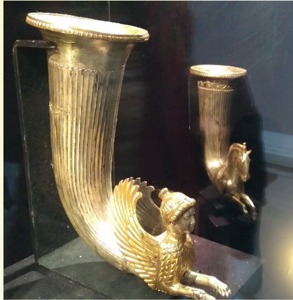
Borovo Silver Treasure – one of the oldest gold in Bulgaria

To date, more than 100 Thracian treasures have been excavated in Bulgaria, the cradle of the Thracian civilization.