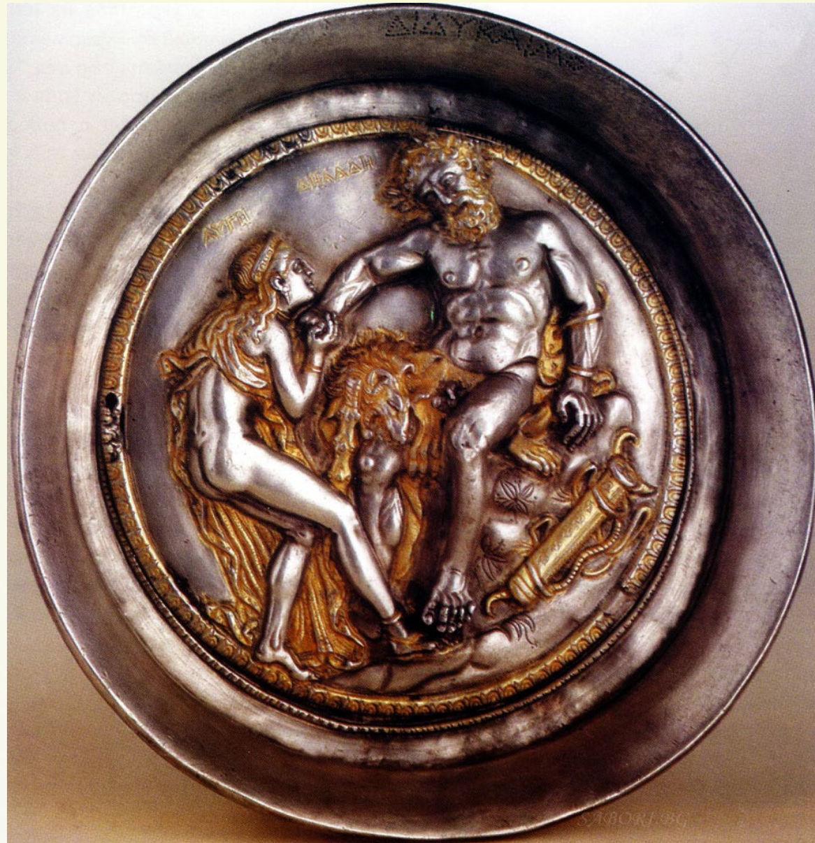
Rogozen Treasure - Wikipedia