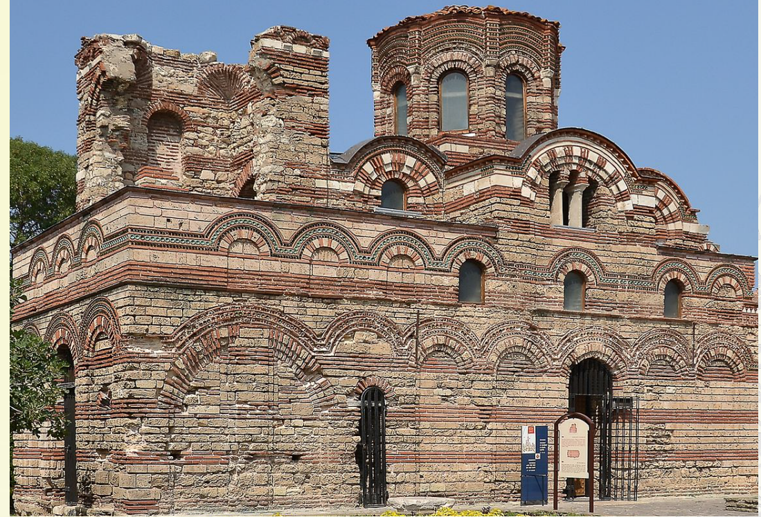
CHURCH OF CHRIST PANTOCRATOR, NESEBAR (BY PUDELEK) - NESEBAR - WIKIPEDIA

The ancient city of Nesebar, now a UNESCO World Heritage site, was the Thracian settlement of Mesembria for many centuries before BCE. The Valley of the Thracian Kings with more than 80 tombs (around Kazanlak)